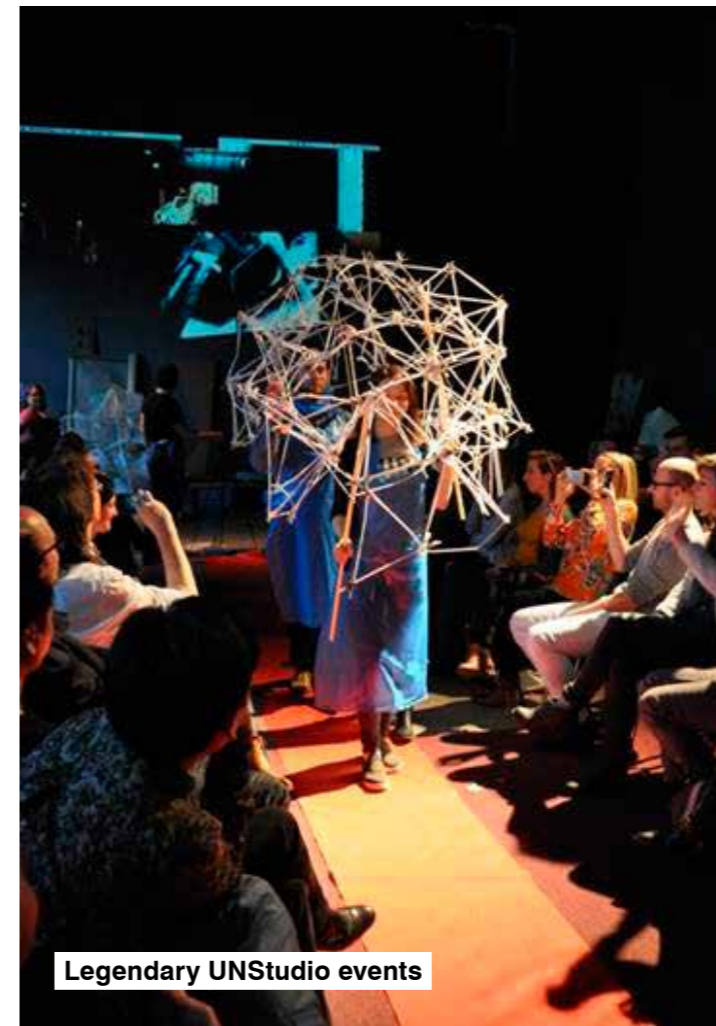
Legendary UNStudio events

You are considered a highly valued member of the team and are encouraged to voice your ideas and suggestions throughout the project process