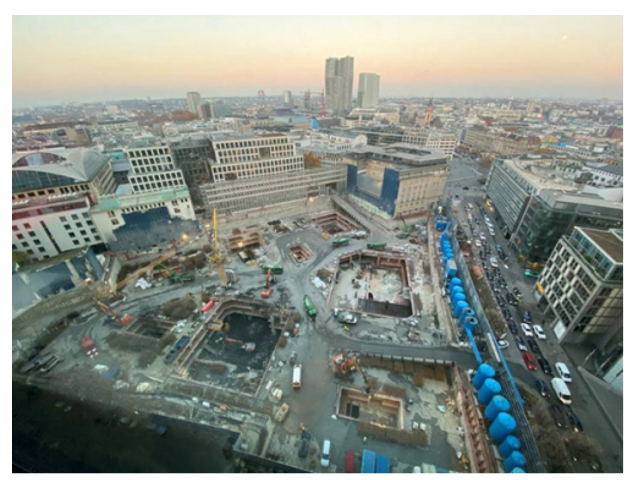
Construction site FOUR in Frankfurt

head office, all the offices in our practice work in close collaboration and support one another.