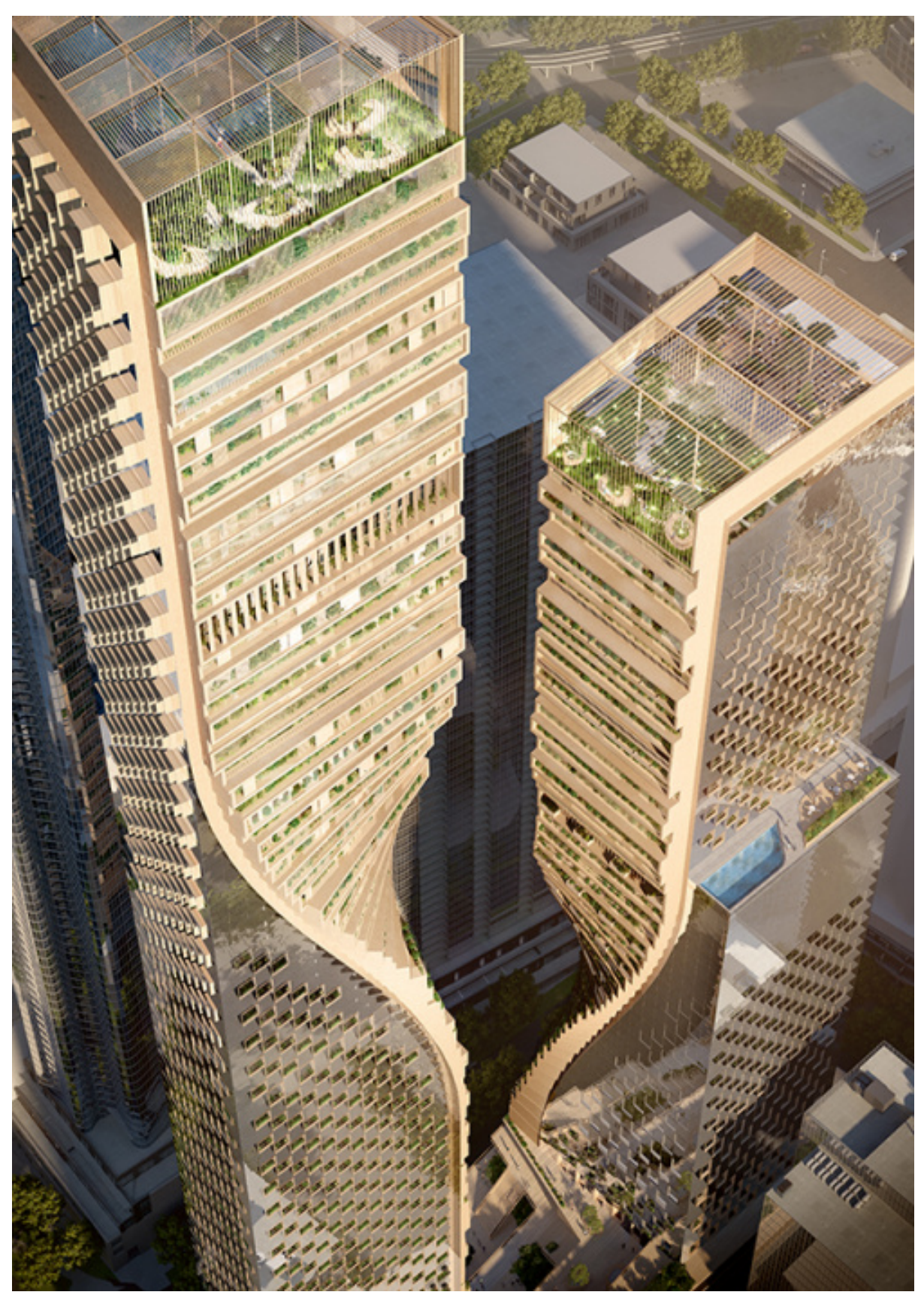
Rendering of the Southbank by Beulah Project in Melbourne.

in a pivotal Dubai location in the vicinity of the city's emblematic the Burj Khalifa, will have one of the world's tallest ceramic facades.