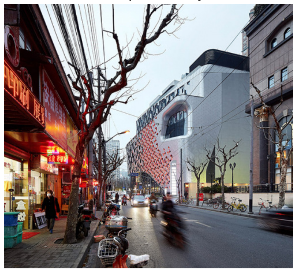
Lane 189, Shanghai.