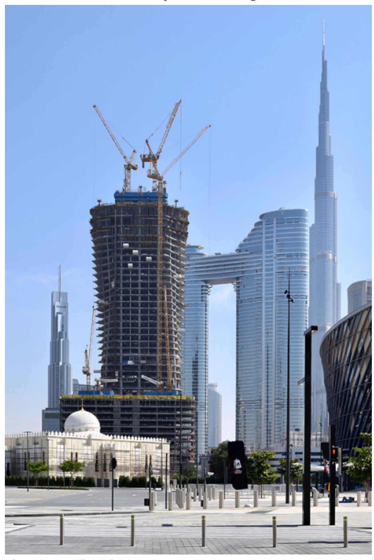
Constucting the wasl Tower in Dubai

Meanwhile in Dubai, the construction of the wasl Tower is going full steam ahead and will soon reach its highest point of 302 metres. This super-high-rise structure,